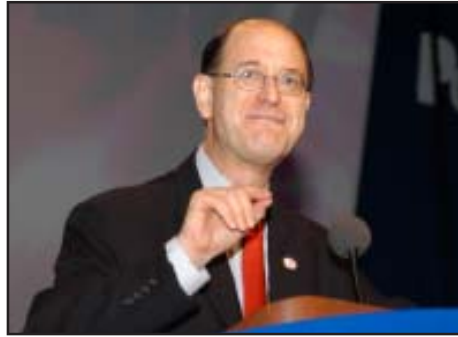
Congressman Brad Sherman (D-CA)

“We have to work to make sure we do not have unjustified work-sharing discounts,” he said. “We cannot be giving away postal revenue and taking jobs away from those who have moved the mail for