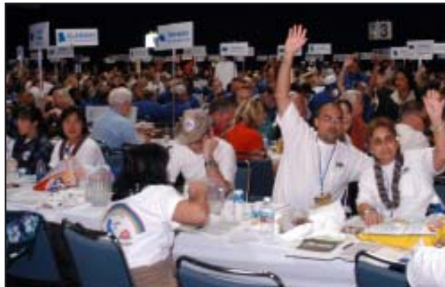
Delegates spent Thursday waiting their turn at the microphones, listening to debate, and taking part in voice votes and teller counts.

A constitutional amendment was adopted that will correct an inequity in the Northeast Region that prevents APWU members working at the Dominick V. Daniels Facility and New Jersey Bulk Mail Center from voting for the national business agents that represent them. Although the facilities are in New Jersey, they are part of the New York Metro Local, and are represented