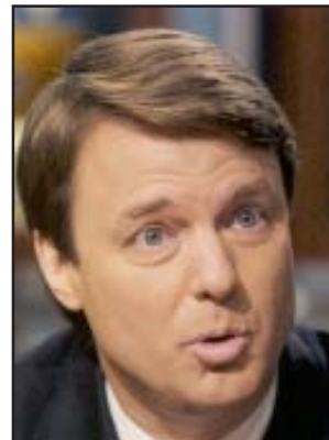
Delegates cheered when John Kerry’s running mate John Edwards said, “We will never privatize the Postal Service.”

uniform rates is the hallmark of the Postal Service, and we should do everything possible to protect it.