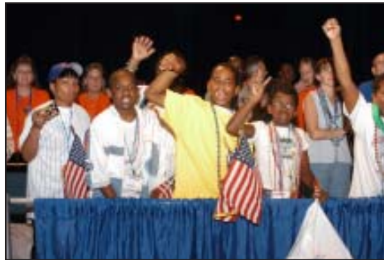
The Parade of States must go on, on the night before the last day of the APWU Biennial Convention. Per custom, some of the states featured a lot of Local flavor.