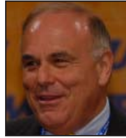
Edward G. Rendell