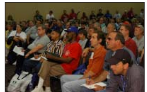
Delegates pack the "RI-399 Meeting" room.

A resolution that would establish priorities for the upcoming contract negotiations with the Postal Service will be acted upon when delegates revisit the Labor-Management Committee Report on Wednesday.