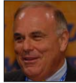
Edward G. Rendell