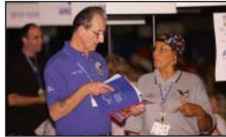
Delegates discuss a resolution before lining up at a floor microphone to take part in the debate.

The convention adopted Resolution #59, which seeks payment to employees covered by the Federal Employee Retirement System (FERS) for unused sick leave upon retirement. The resolution is intended to address an inequity between FERS employees and Civil Service Retirement System employees (the CSRS computations give credit for unused sick leave).